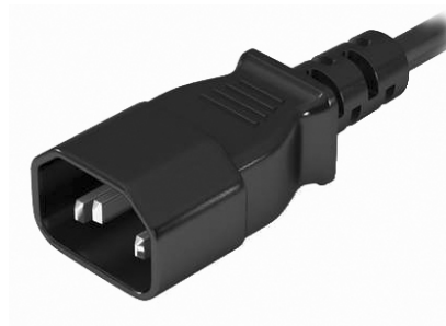
10A C14 Output Connector Plug