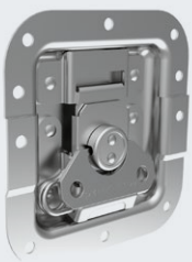
SMOL3® MEDIUM RANGE