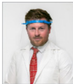
How to Wear